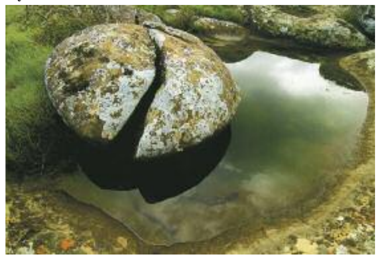
"Black Meadow Pool

Majority of his career photo- places I was very fortunate to graphing nature in Northern California, from Yosemite to Mount any other spot like that." Diablo. He enjoys challenging himself to capture both famous the unique textures created from and everyday sights in unique ways. Unlike his other collections, however, the name of his most recent exhibition at the Saint will not ring a bell for most locals: Vasco Caves.